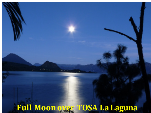
Full Moon over TOSA La Laguna

Rates include Double occupancy, ground transportation from/to the Airport in Guatemala City, boats and ALL meals lovingly crafted according to Soul Nourishment Spa Cuisine guidelines. Your airfare to and from Guatemala City is not included, and your airport departure tax, (approx. $5) is not included.